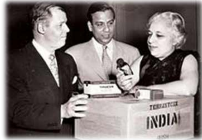
The medicines of Pfizer worked miraculously. The business